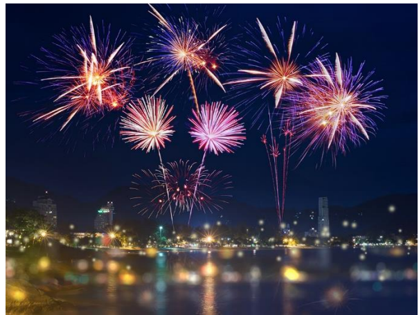
2021- Fireworks in Purikali

Purikali - Speaking to the national TV network yesterday evening, King Kira II greeted the people of the three nations of UIEMB, the Union of Eastern Banda Sea Islands, for the 50th anniversary of the organisation, founded on May 7th, 1971. His Majesty recalled the diplomatic effort of the former minister of foreign affairs Melwet Umalui as fundamental to the signature of the Treaty by King Wasahi I of Kaupelan and the presidents of Santoi and Terra Aurea. After the king's speech, there was fireworks display at the bay of Masar, transmitted by TV.