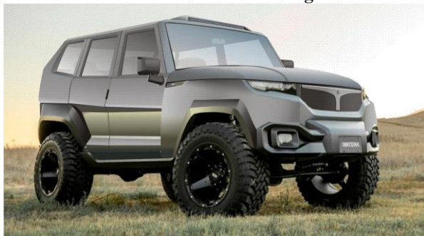
Watera shows the new Strider EV for 2023

Another area that will be stimulated is the sector of electric vehicles, both for imported and locally produced vehicles. The goal of reaching more than 30% of the entire fleet by 2030 is more than double of the goal set in 2018. Page 2